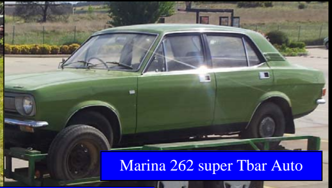
Marina 262 super Tbar Auto