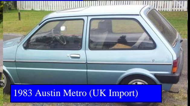
1983 Austin Metro (UK Import)