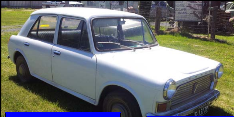
Morris 1500 5 speed