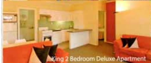
King 2 Bedroom Deluxe Apartment