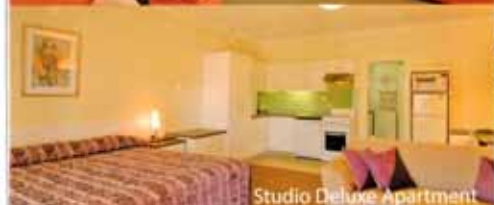
Studio Deluxe Apartment