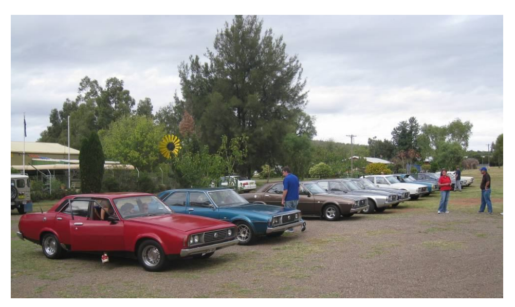
Gathered outside the Rural museum before the Saturday run to Premer.