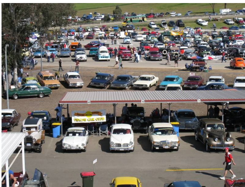
View from the top of the pits. We are the ones behind the open garages.