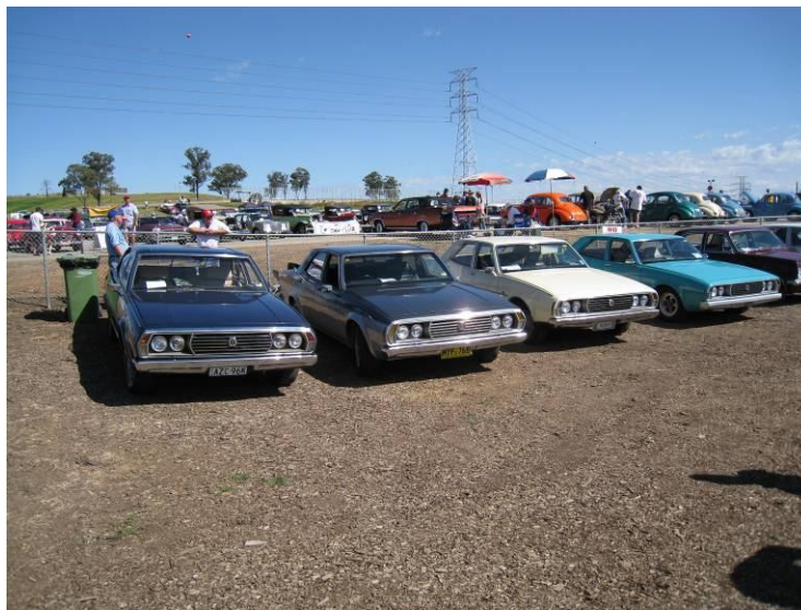
Shannons day at Eastern Creek