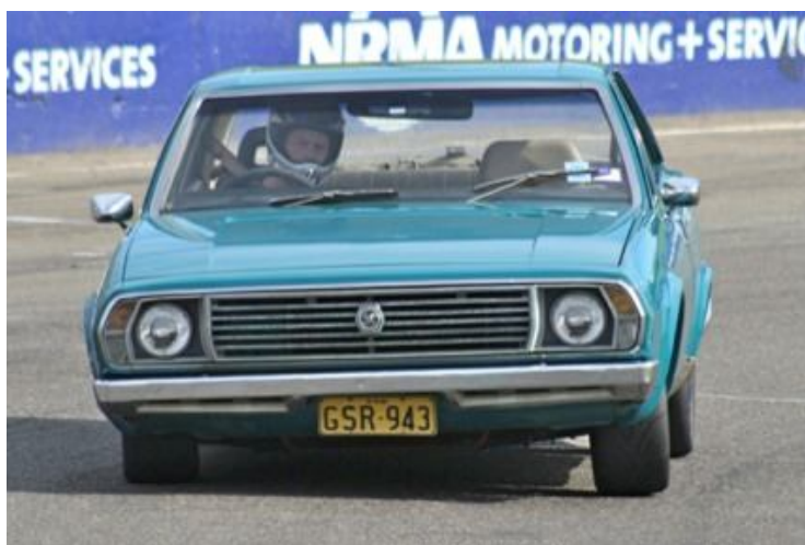
Marty's race car at an Oran Park track day.