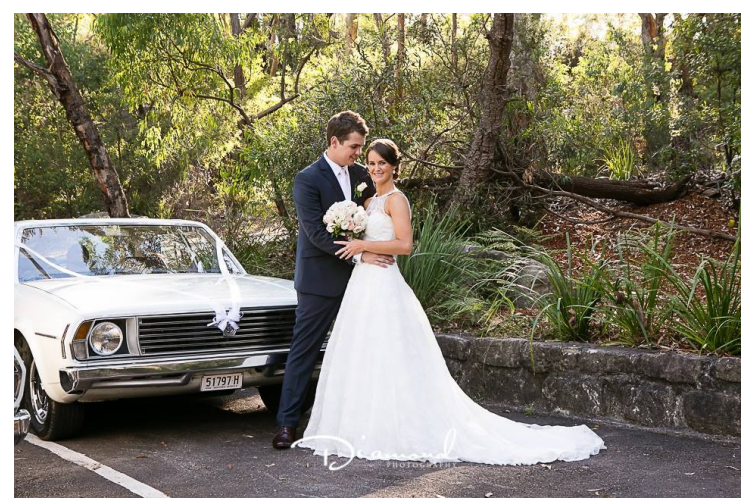
The guests at the wedding were particularly complimentary of the cars and the way that they were presented on the day.