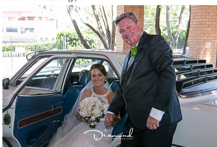
The guests at the wedding were also complimentary in their attention to the cars. The P76s certainly looked great in the background of photographs taken at the Church and also at Oatley Park, following the marriage ceremony, where bridal photos were taken.