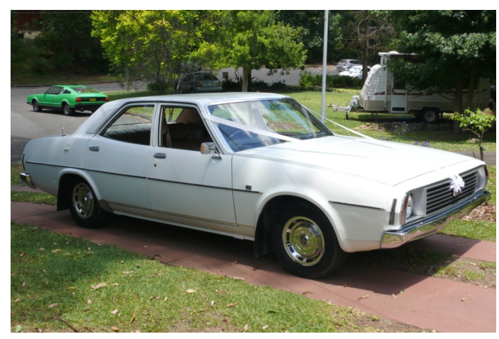
The three P76s attracted a lot of attention along the way with "thumbs up", beeping of car horns & shouting as we passed by. (Graham Foy arrived in Warrewyk Williams' Force 7 just as we were leaving.)