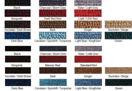
Optional Black Plush Pile