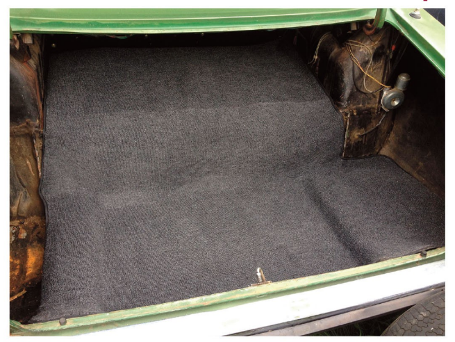
Original Style Charcoal Loop Pile