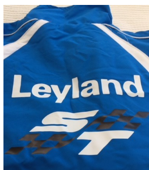
Rear of the Rally Jacket