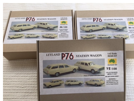
P76 Station Wagon Kits - $75 Unbuilt