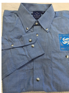
Blue Club Chambray Shirts $40