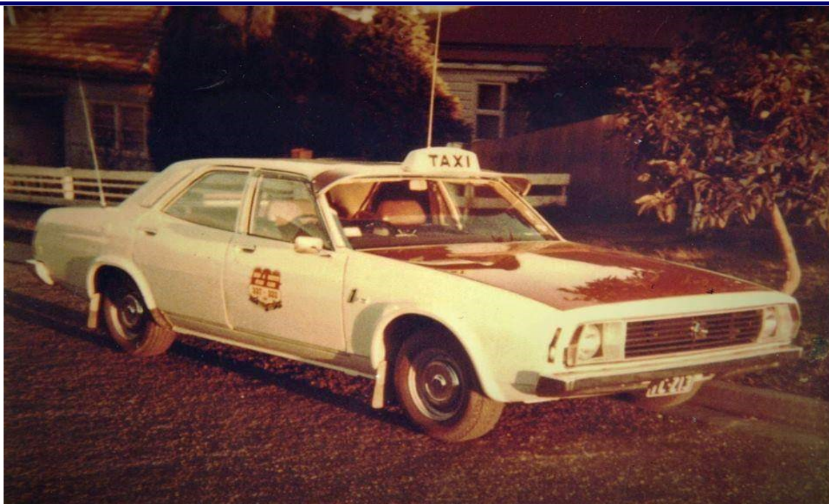
Ken Hartup's Deluxe P76

The CMC now have more than 180 affiliated car clubs to cater for and early interest in spots at the Shannons sponsored event has been very strong. We have booked a similar number of spaces to last year and entry tickets will be available shortly, so if you intend going you will need to contact Kay as bookings have been strong and there are only a couple of tickets left.