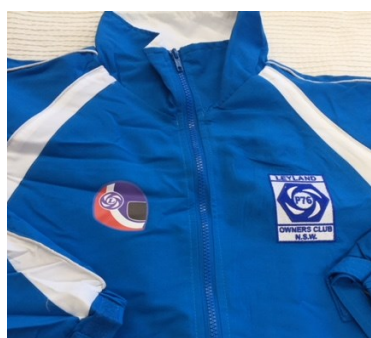
Club & Rally Logo on Front Rally Jacket