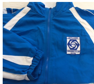
Club Jacket Plain - $45.00