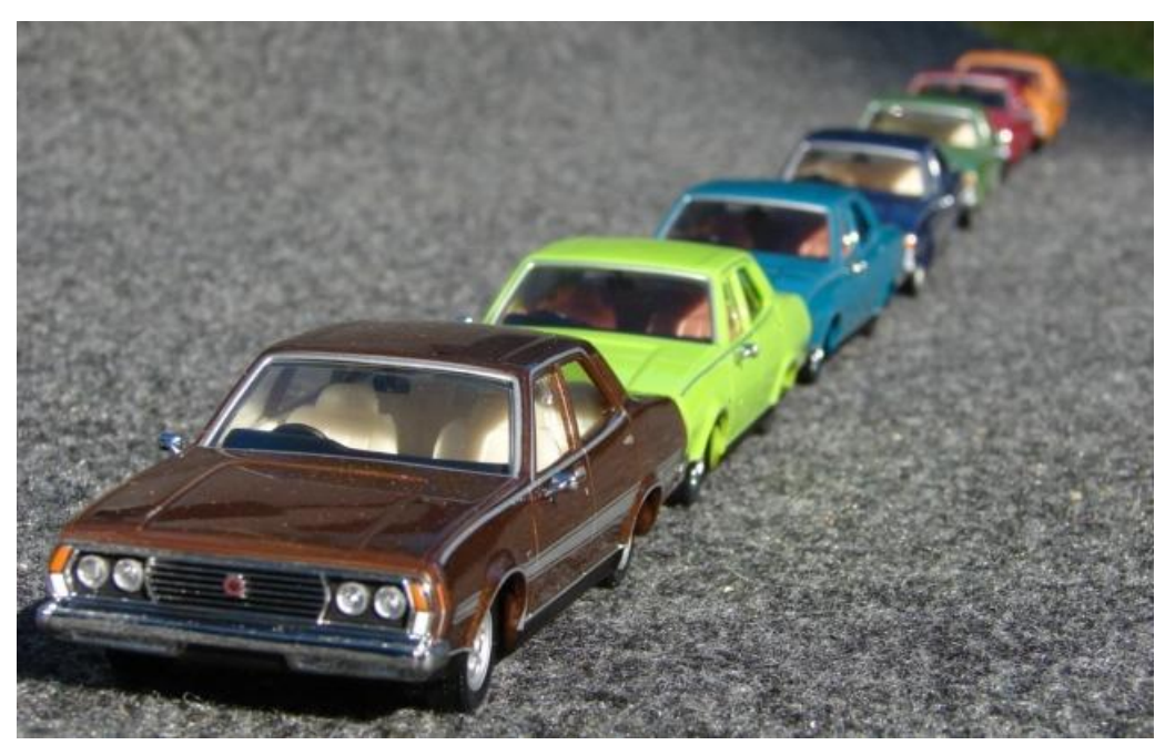
7 ONLY CARS LINING UP FOR THE NATIONALS 2015

Phone 0883238265 email <u>info@mclarenvalemotel.com.au</u>