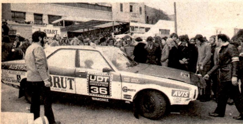
Being the first appearance in London of the Australian built Leyland P76, the Green/Bryson car drew many curious onlookers.

How about another run back across the Sahara to round it all off? We could well pull right through to first now that we know where to go!