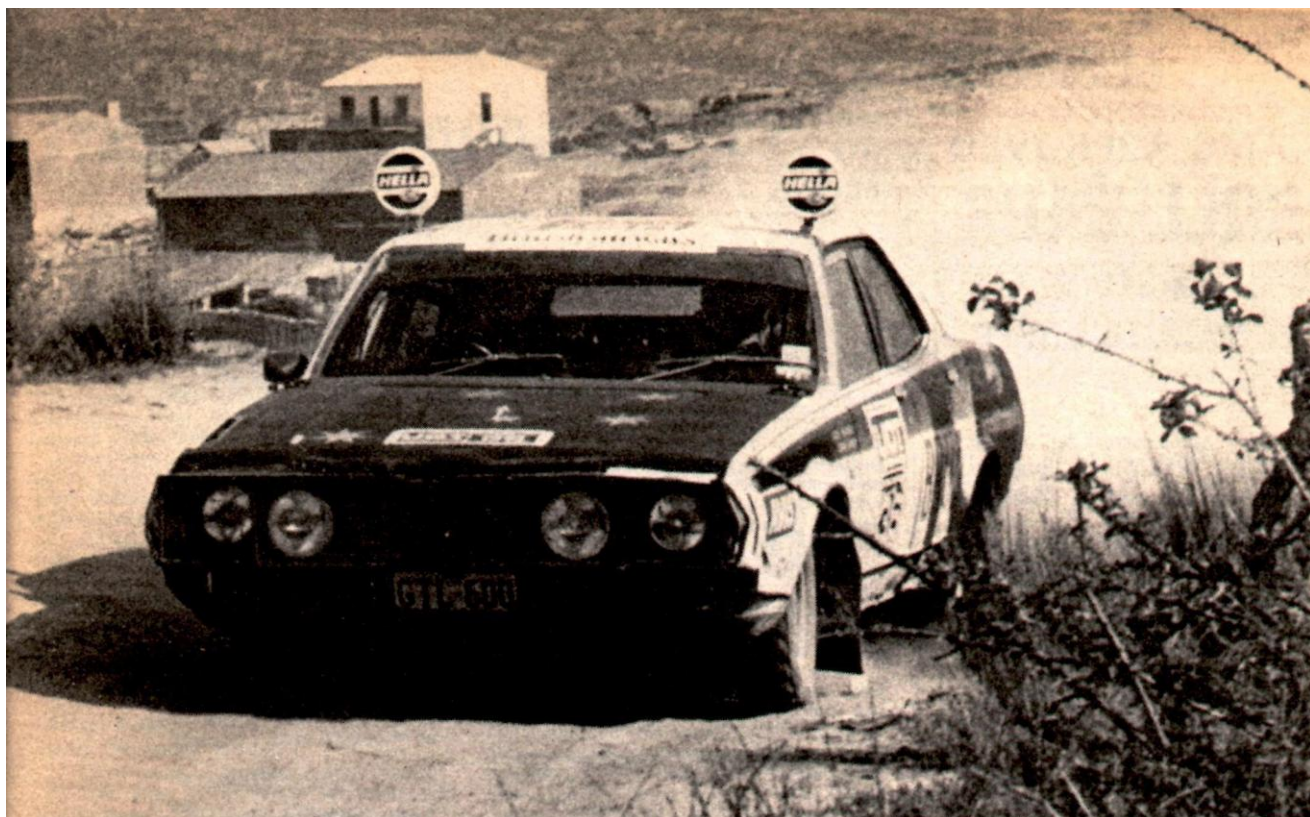
With its fuel feed problems overcome, the BRUT 76 charges through Spain, where it set times on special stages fast enough to recover almost 20 places.