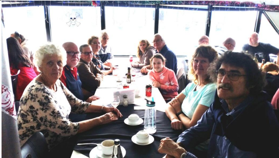
Christmas Lunch on the Dolphin Explorer Cruise Port River Port Adelaide