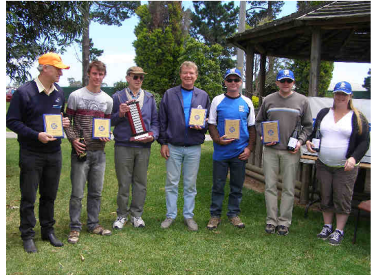
The Trophy Winners