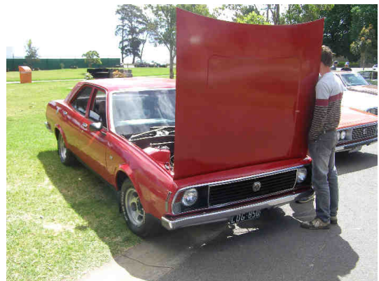
Best Modified - Grant Hutcheon