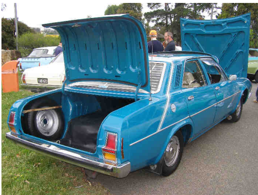
Peoples Choice - Don Morrison