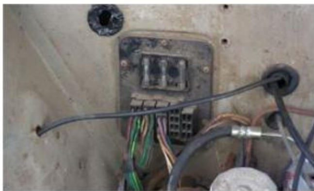
Left: Sophisticated tri- fuse Morris electrical system