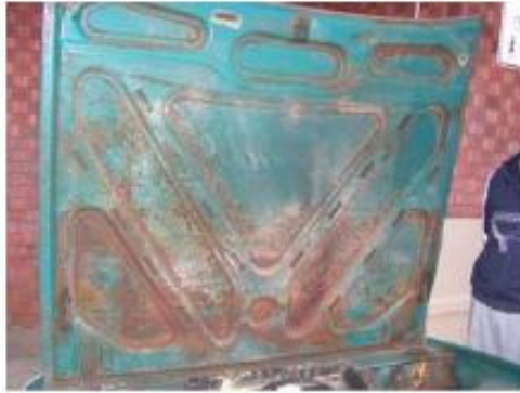
P76 in need of an under bonnet insulation kit.