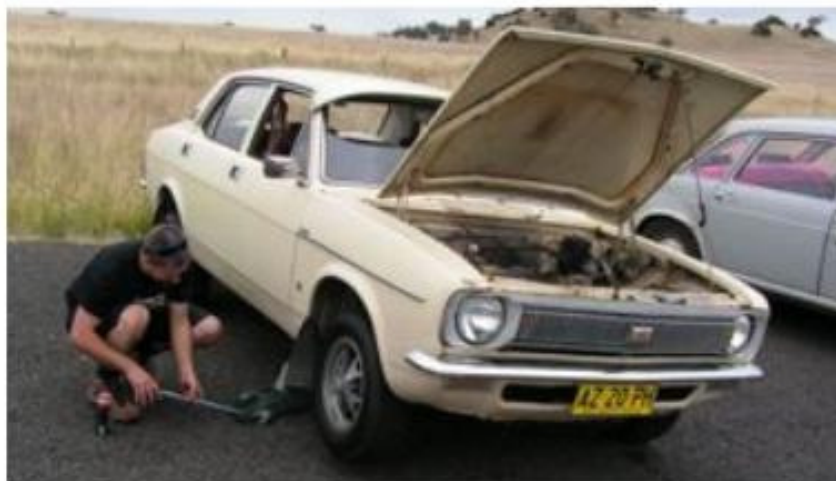
Brian Hooper effecting running repairs on a thrashed bunkie Marina.