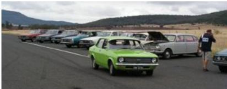
Above: Hairy lime Marina drops in