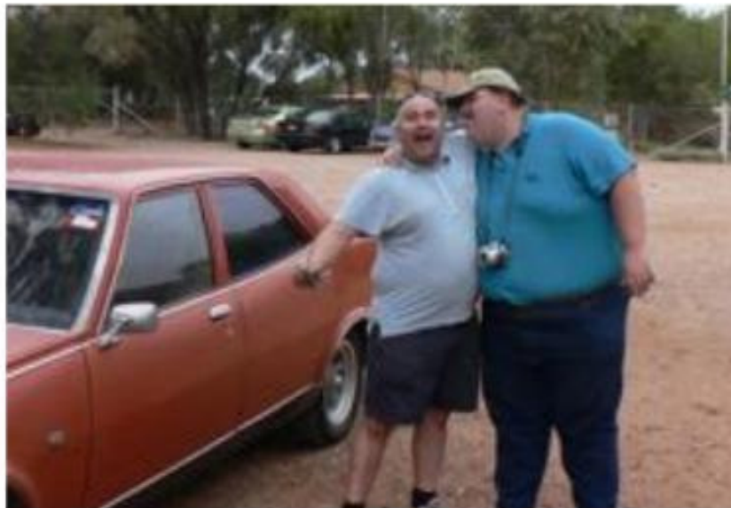
Two idiots clowning around after eating koala steaks

The evening was a lot of fun, and capped off a very well run and organised event. The next day I drove back to Canberra in the rain almost all the way. If anyone wants a fun drive, I recommend the unsealed rode between Bathurst and Goulburn. Rain, hills, hairpin turns, dirt roads. The quadrella.