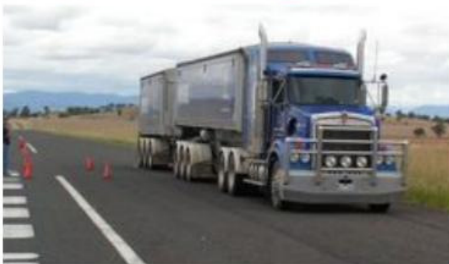
Below: The event had to stop for a few moments from time to time while traffic went past