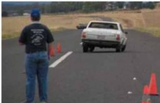
Above: Leyland's at the Airstrip.