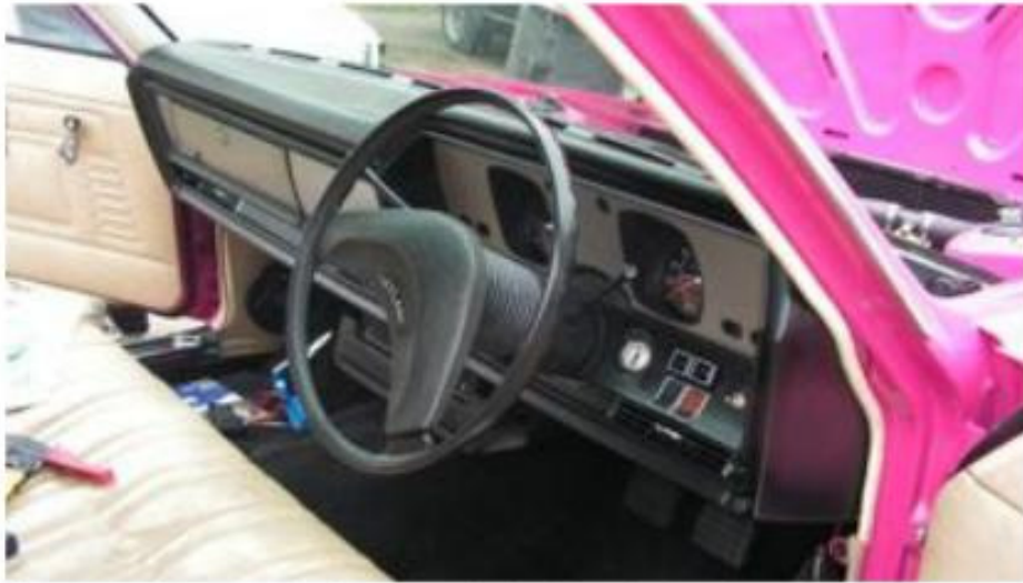
Above: Bench seat, standard steering wheel, deluxe dash and trim.