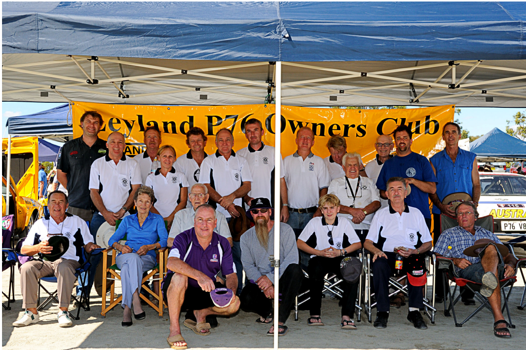
Some of the members and friends that we managed to round up for a group photo at Pinjarra.