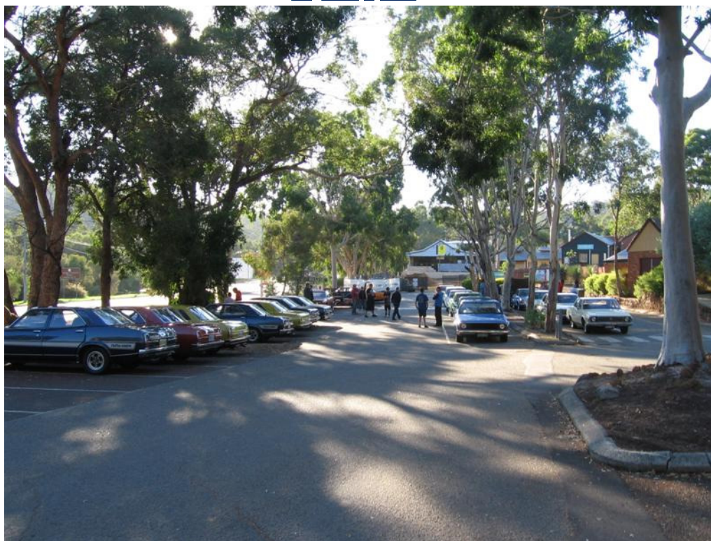
All-Aussie Car Day muster at Pioneer Village, Armadale, prior to the club run to Pinjarra.

OFFICIAL PUBLICATION OF THE LEYLAND P76 OWNERS CLUB OF AUSTRALIA (WA DIVISION) Inc