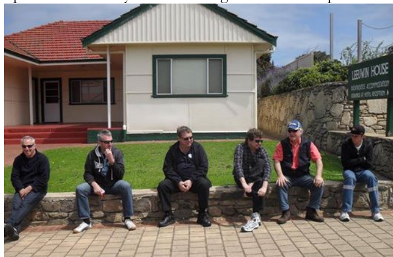
The lads enjoy a relax in Augusta before the long drive back to Perth

Meanwhile the rest of the crew carried on with the weekend, that included a visit to Augusta in the deep south on Sunday before tackling the 300+km trip home to Perth.