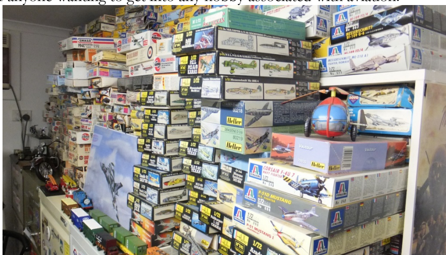
For those who have idle moments to fill.