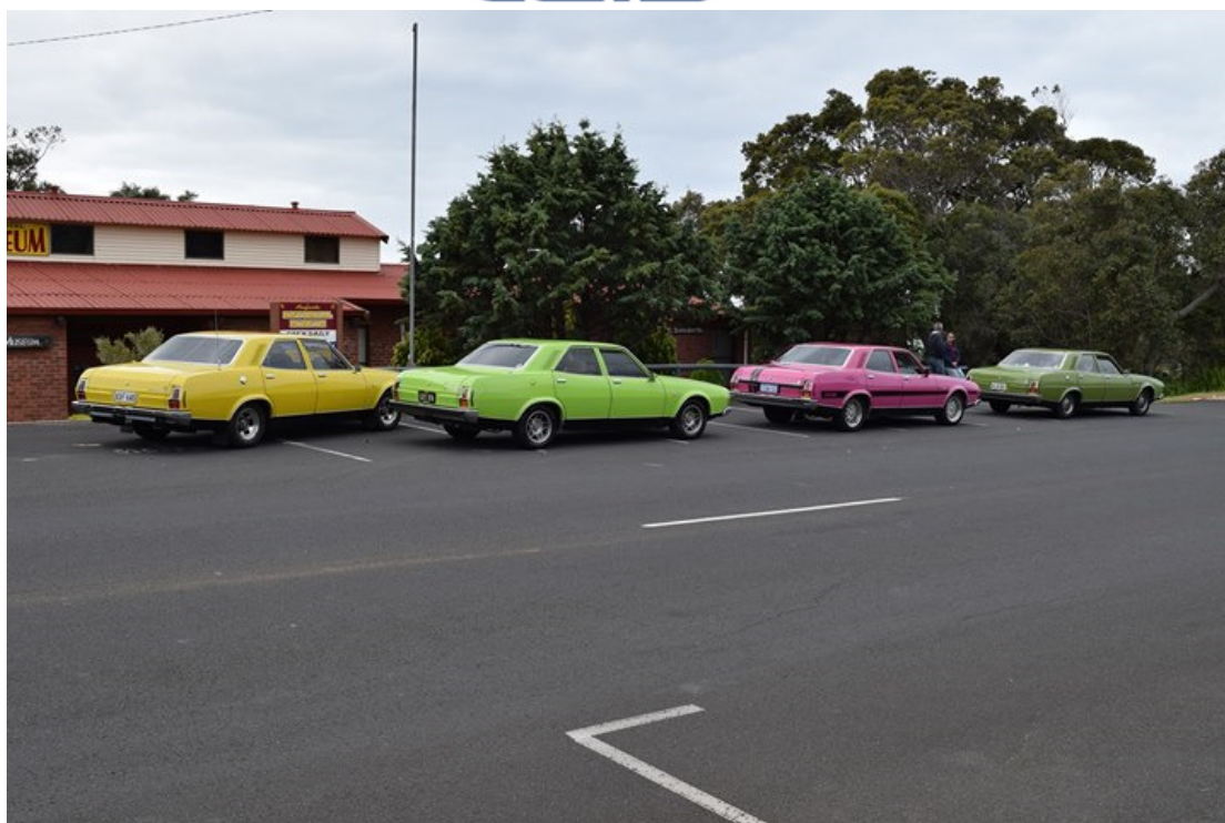
Four of the Club's finest examples parked at the Avarina Estate Sportscar Museum, Yallingup.

OFFICIAL PUBLICATION OF THE LEYLAND P76 OWNERS CLUB OF AUSTRALIA (WA DIVISION) Inc