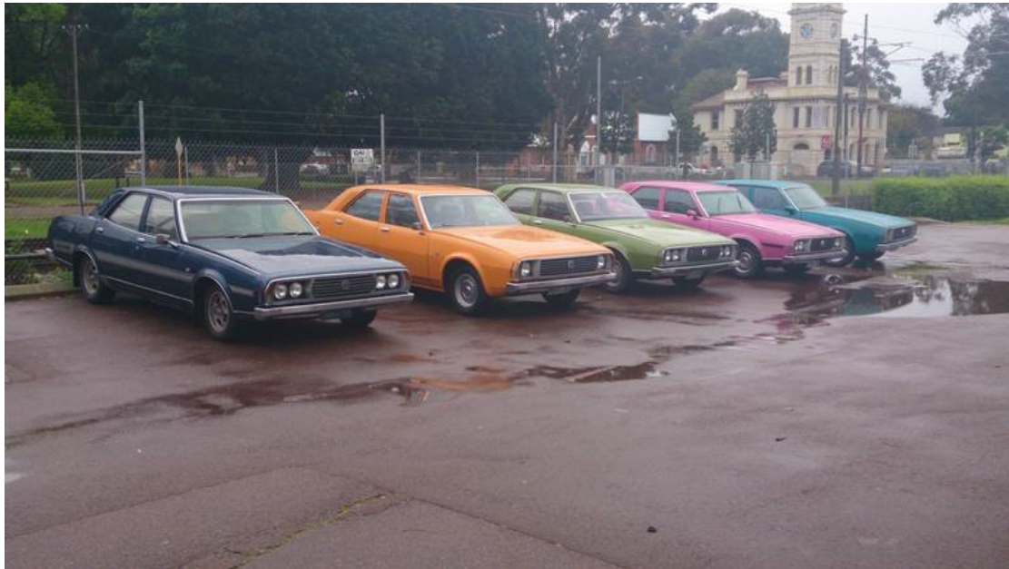
Five of the six cars that made it to Alfred's Kitchen in Guildford