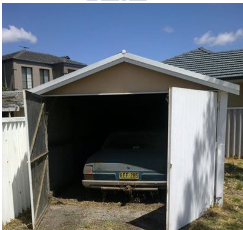
The car enthusiast's dream: a long-lost shed or barn find

OFFICIAL PUBLICATION OF THE LEYLAND P76 OWNERS CLUB OF AUSTRALIA (WA DIVISION) Inc