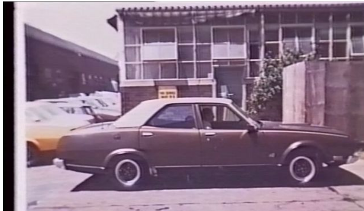
The missing C-pillar vents

The accompanying photos clearly show the bonnet and C-pillar changes but as yet we have no pictures of the boot or interior modifications. The wheels look interesting