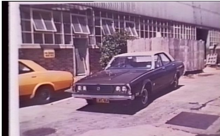
The bonnet scoop