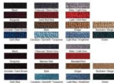
Optional Black Plush Pile