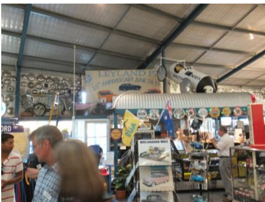
The P76 25 th Anniversary banner on prominent display at the Motor Museum of W.A.

OFFICIAL PUBLICATION OF THE LEYLAND P76 OWNERS CLUB OF AUSTRALIA (WA DIVISION) Inc