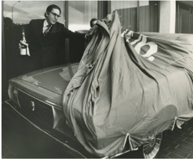
Kep Enderby, Minister for the ACT, unveiling the P76 on 26 June 1973