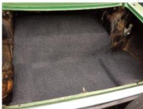
Original Style Charcoal Loop Pile